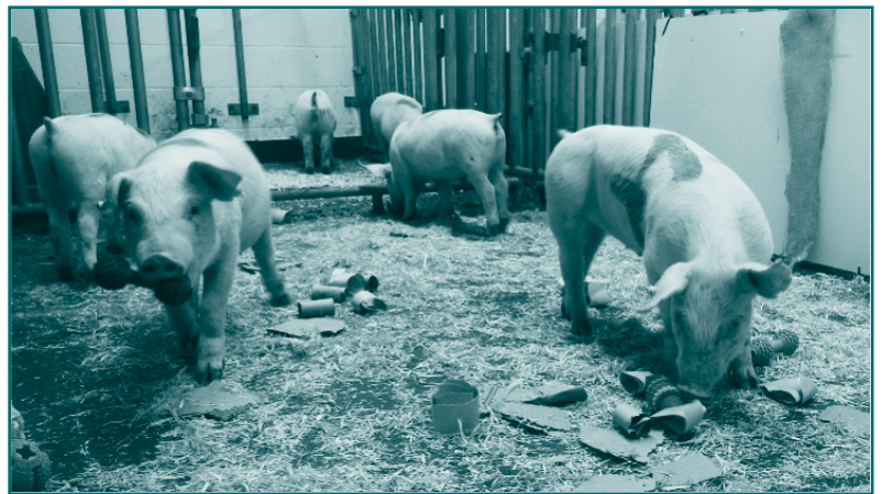
When pigs play, they're happier and healthier, which support their wellbeing and those who work with them in the barn.