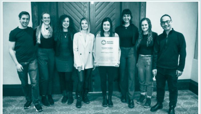
The NSERC IRC in Swine Welfare program wraps up this year, but researchers are looking for continued support.