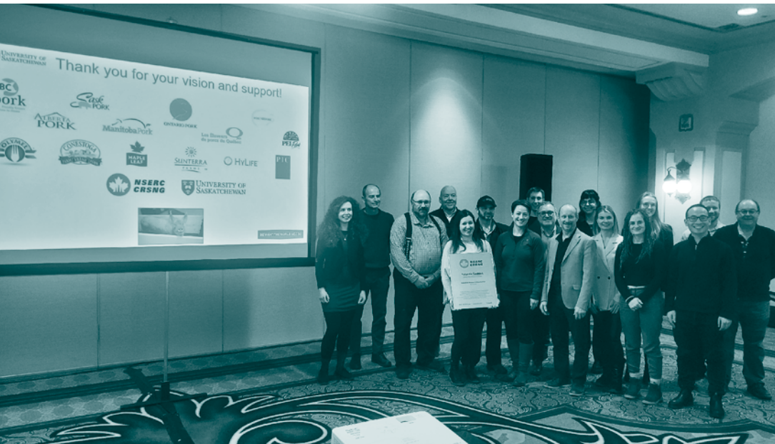
The NSERC IRC in Swine Welfare program was on full display during a forum in advance of the Banff Pork Seminar.